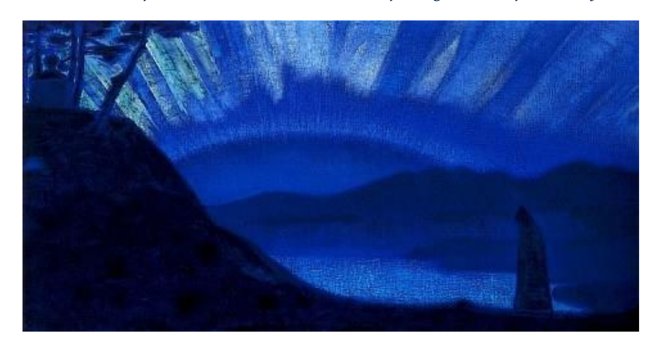
BRIDGE OF GLORY - Roerich

In Service of the Christ and the Great Ones Unfolding the Soul of Humanity