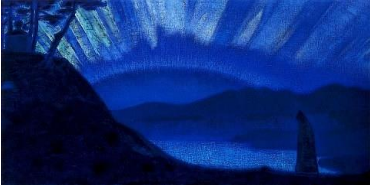
BRIDGE OF GLORY - Roerich

In Service of the Christ and the Great Ones for the Unfolding Soul of Humanity