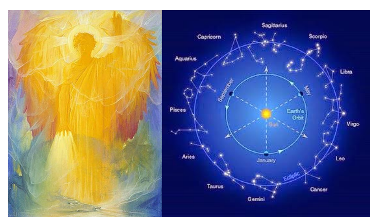
Angel of Aries

In Service of the Christ, Flowering the Soul of Humanity and Manifestation of the Plan