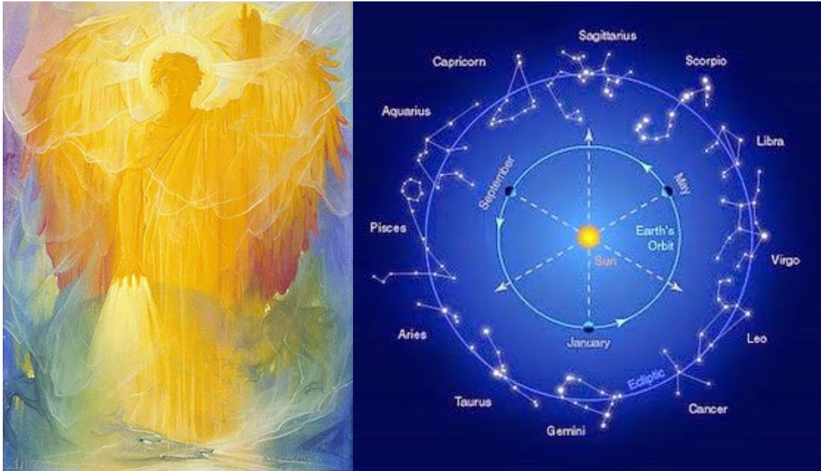
Angel of Aries

In Service of the Christ, Flowering the Soul of Humanity and Manifestation of the Plan