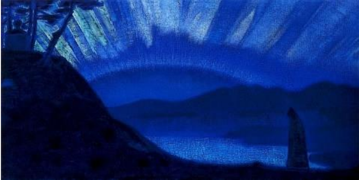
BRIDGE OF GLORY - Roerich

In Service of the Christ and the Great Ones Unfolding the Soul of Humanity