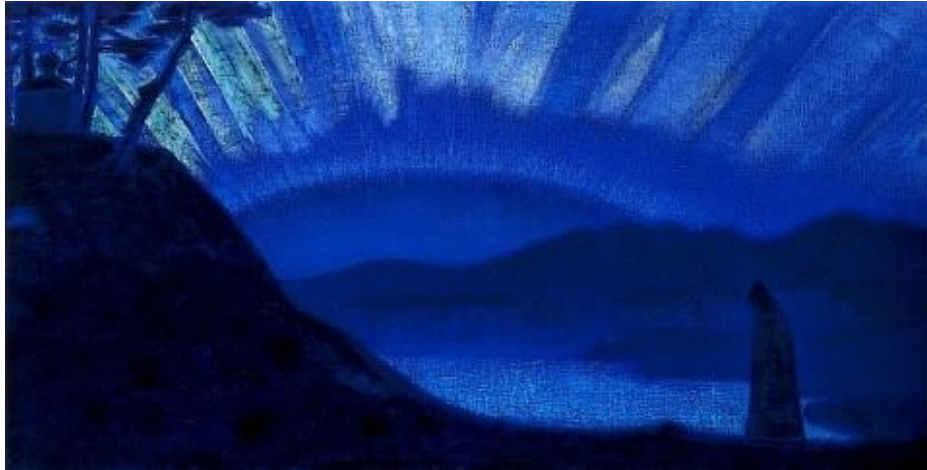
BRIDGE OF GLORY – Nicholas Roerich

In Service of the Christ for the Full Flowering of the Soul of Humanity and the Plan